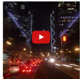
Epic Video of Hong Kong Wins Sony Competition hk.localiz.com