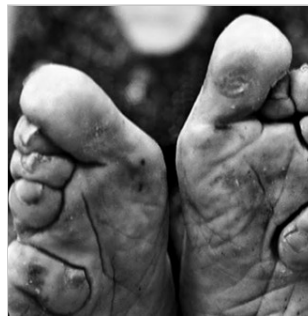
Forgotten Feet: The Mission to Keep the Stories of China’s Last... hk.localiz.com