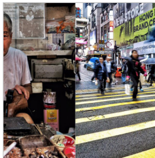
PHOTOS: Old and New Collide in Stunning Photos of Hong Kong hk.localiz.com