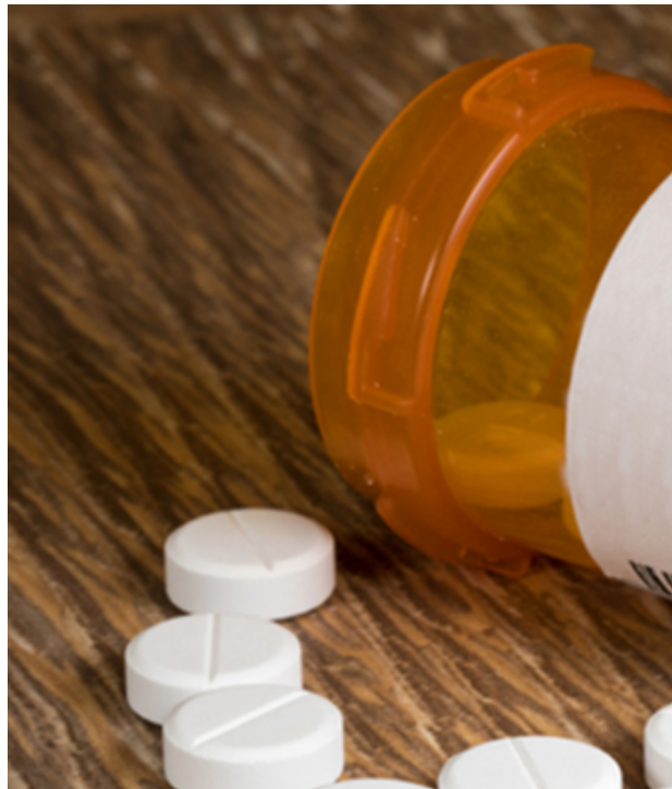
Many young people believe their age protects them from drug use.