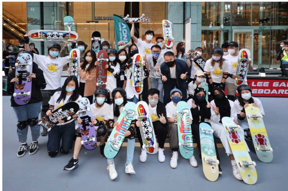
Some Hong Kong kids got a chance to try skateboarding over the weekend as part of a charity event.

Hongkongers got a chance to try their hand at some kick flips and ollies this past weekend in the driveway of Lee Garden One on Pak Sha Road.