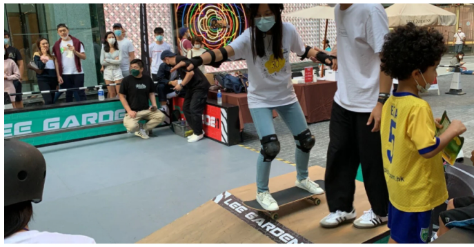
The two day event raised money for the KELY Support Group, which focuses on youth mental health in Hong Kong.

Skateboarding made its Olympic debut at Tokyo 2020 as the International Olympic Committee looked to capture the attention of a new generation of athletes moving away from traditional sports.