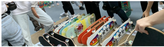
The Lee Gardens Skateboard Fest 2021 featured a charity skateboarding experience for local kids.

According to a study by The Federation of Youth Groups, more than half of Hong Kong secondary school pupils have exhibited signs of depression.