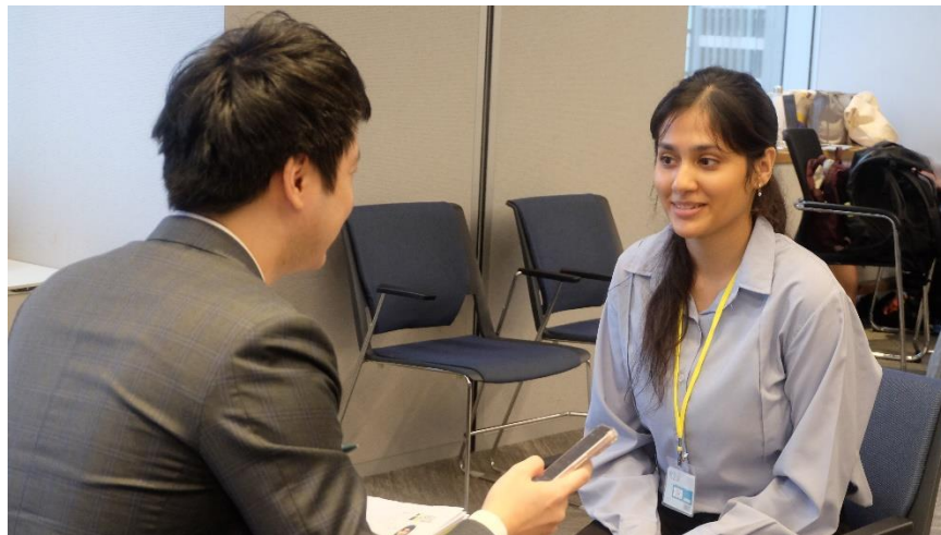
Student participants were arranged to have interviews with SME employers to ensure good matching between skills and placement opportunities.