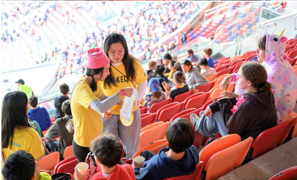
The SOSKELY team and volunteers walked around the higher stands of the stadium to distribute water to young individuals attending the event.