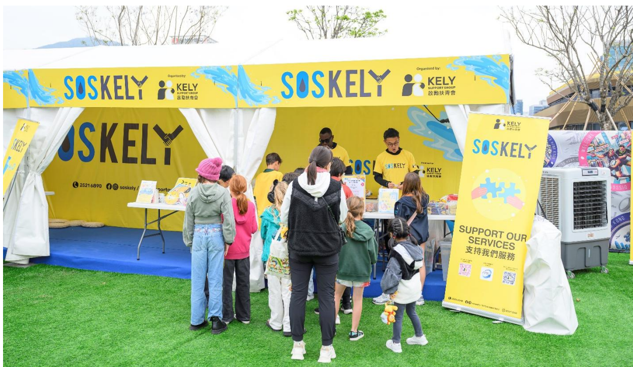
SOSKELY engaged around 1,500 participants at the interactive area and distributed 2,700 souvenirs bearing messages encouraging hydration. These efforts serve as ongoing reminders for youths to make health-conscious decisions.

Please find and download high-resolution photos at: https://bit.ly/soskely2025-hk7s