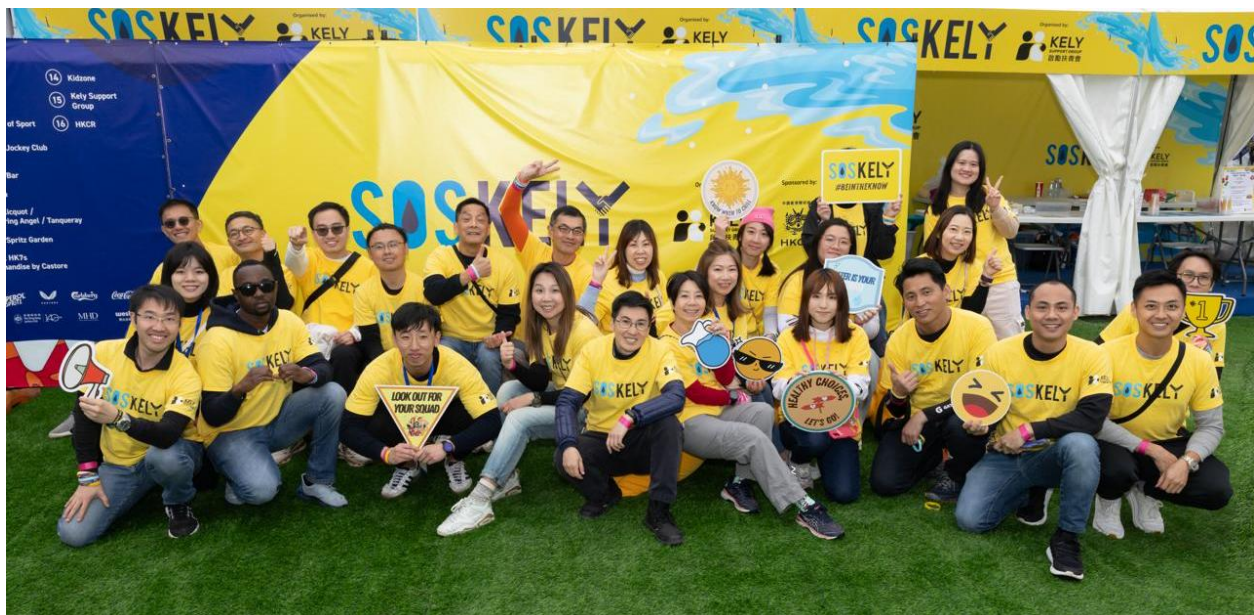
The SOSKELY volunteers included a diverse group of university students, professionals, parents, and teachers, exemplifying the community's collective support for young people.